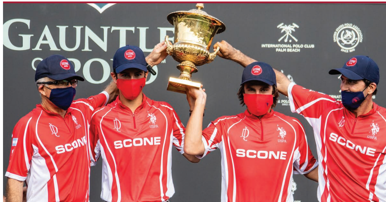
U.S. POLO ASSN. CONGRATULATES THE USPA GOLD CUP® FINALISTS TEAM SCONE AND TEAM TONKAWA