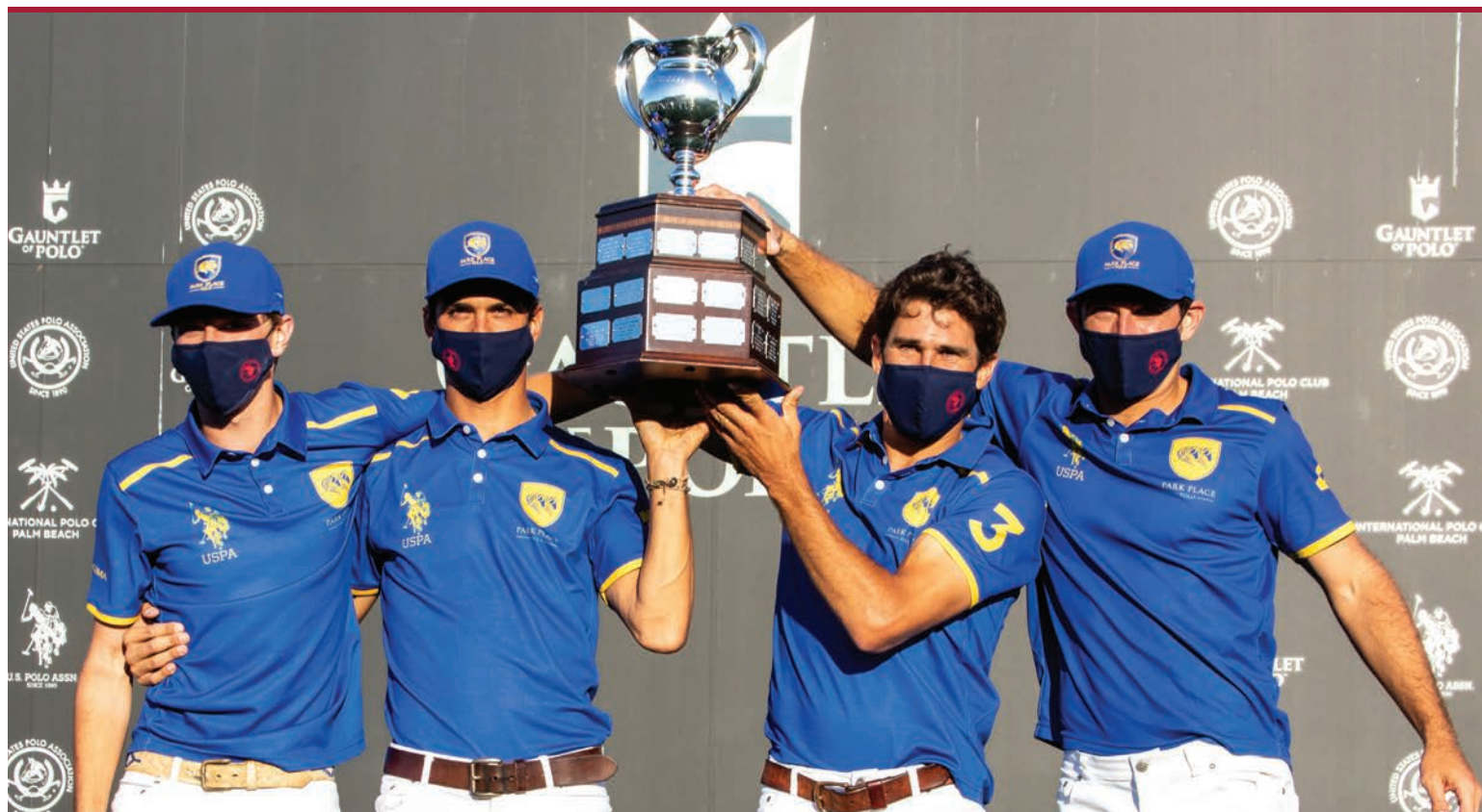
U.S. POLO ASSN. CONGRATULATES C.V. WHITNEY CUP® FINALISTS TEAM PARK PLACE AND TEAM SCONE