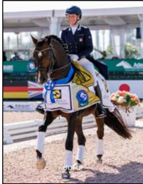
Sabine Schut-Kery and Sanceo won the Grand Prix Special CDI5*, presented by Palm Beach Equine Clinic, at the 2021 AGDF before going on to help the U.S. Dressage team win Olympic silver in Tokyo.

Attending to the veterinary needs of equine competitors in Wellington