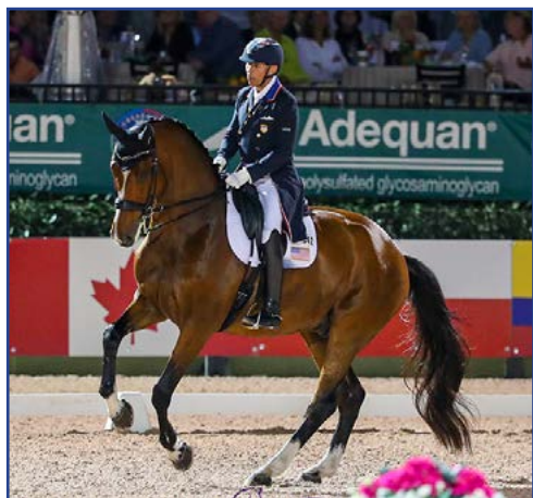
Capturing the gold medal in the FEI Grand Prix Freestyle CDIO3* presented by Stillpoint Farm during AGDF 10 was Steffen Peters and Suppenkasper.

Steffen Peters (USA) conjured yet another winning performance from his blossoming partner, Suppenkasper, to claim the gold in the Nations Cup™ FEI Grand Prix Freestyle CDIO3*, presented by Stillpoint Farm. This takes his tally of wins to 11 from 11 starts in the 2020 Adequan® Global Dressage Festival. The pair scored 81.535%, their second plus-80% freestyle score of the year.