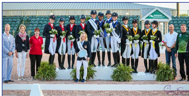
The United States brought home the gold medal in the FEI Nations Cup CDIO3* presented by Stillpoint Farm, while Canada took silver and bronze went to Denmark.

On the second day of competition for the FEI Nations Cup™ CDIO3*, presented by Stillpoint Farm, on Thursday, March 12, at the Adequan® Global Dressage Festival (AGDF), the team from the USA took the gold medal with 439.992 points. The Canadian team took silver with 436.034 points, and Denmark was awarded the bronze with 424.501 points.