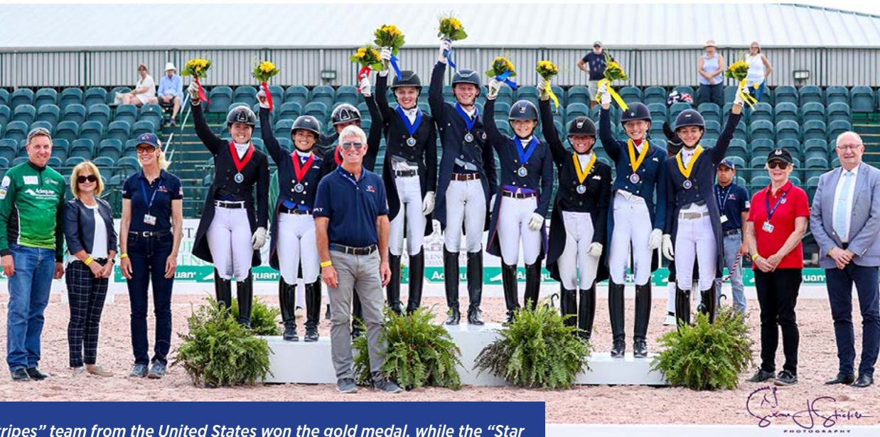
The “Stars and Stripes” team from the United States won the gold medal, while the “Star Spangled” team from the U.S. took silver and Canada won bronze in the Nations Cup CDIO-U25 presented by Diamante Farms.