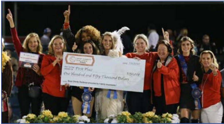
The winning team with their charity representatives from Spirit of Giving Network.

Palm Beach County cheered as equestrians and their mounts, representing local non-profit organizations, competed for a share of more than $1 million in prize money at the Great Charity Challenge presented by Fidelity Investments® (GCC) on Saturday, February 1. Held at the Palm Beach International Equestrian Center (PBIEC), the GCC has become a highlight of the 12-week Winter Equestrian Festival (WEF) and has distributed over $15.8 million to more than 256 local organizations in 11 years.