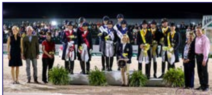
The United States brought home the gold medal in the FEI Nations Cup CDIO3* presented by Stillpoint Farm.

The tenth week of the AGDF hosted the FEI Nations Cup CDIO3* presented by Stillpoint Farm. The USA, Canada, Germany, Colombia, and Mexico had teams competing. Competition began on Wednesday with two classes, the FEI Prix St. Georges and the FEI Grand Prix.