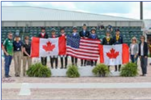
The team from the United States won the gold medal, while Canada 1 was silver and Canada 2 was bronze in the Nations Cup CDIO-U25 presented by Diamante Farms.

The opening day of competition at the 10th week of the 2019 AGDF featured the Nations Cup CDIO-U25 presented by Diamante Farms. This is the third year that AGDF hosted CDIO-U25 competition, offering a great stepping-stone of international competition for young riders.