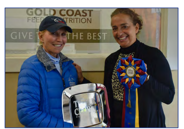
win in the CDI 1* Prix St George on Swiss W with a 71.6%.