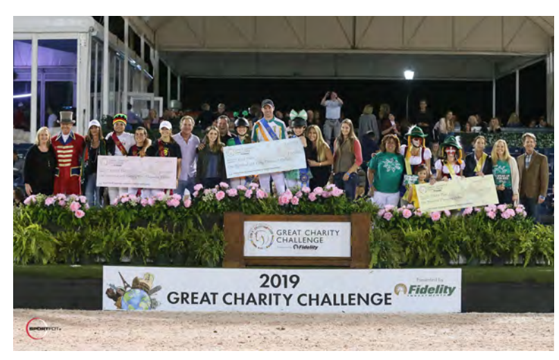
The top three teams, along with their charity and team sponsor representatives, for the 2019 Great Charity Challenge, presented by Fidelity Investments®.

CROWNS HOLY GROUND SHELTER FOR THE HOMELESS AS WINNER