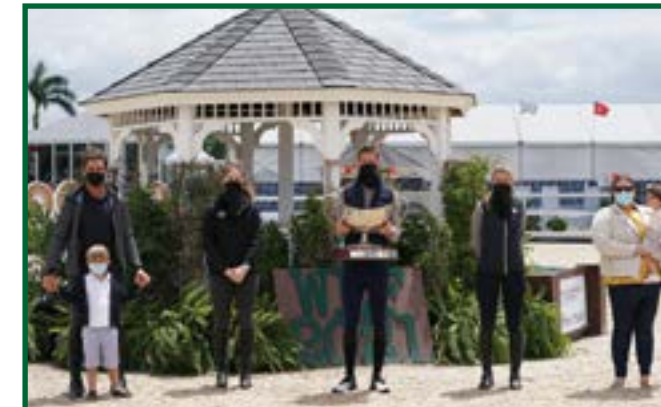
Stephex Stables was presented with The Harrison Cup Perpetual Trophy, which is awarded to the owner whose horses won the most jumper money in all of the open jumper classes held throughout the circuit.