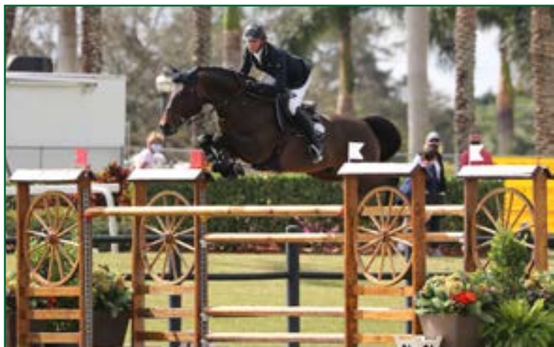
Ben Maher and the 18-year-old stallion Tic Tac won the first grand prix on the grass Derby Field at the 2021 WEF.