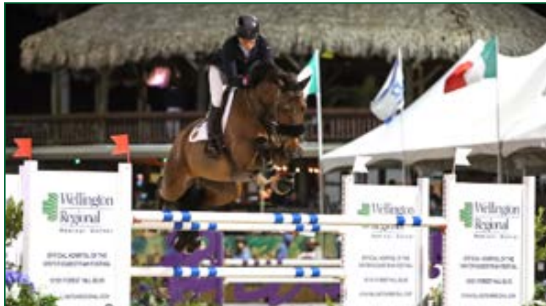
Beezie Madden and Breitling LS showed how it's done in the $137,000 Wellington Regional Medical Center Grand Prix CSI3*.