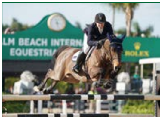
McLain Ward and Catoki were fastest to win the opening feature of the 2021 WEF, the $75,000 Bainbridge Companies Grand Prix.

McLain Ward (USA) capped off the first week of competition with top honors on Sunday, January 10, in the $75,000 Bainbridge Companies Grand Prix at the 2021 Winter Equestrian Festival (WEF). Ward and Catoki topped four speedy entries with the only double clear effort of the day to claim the title.