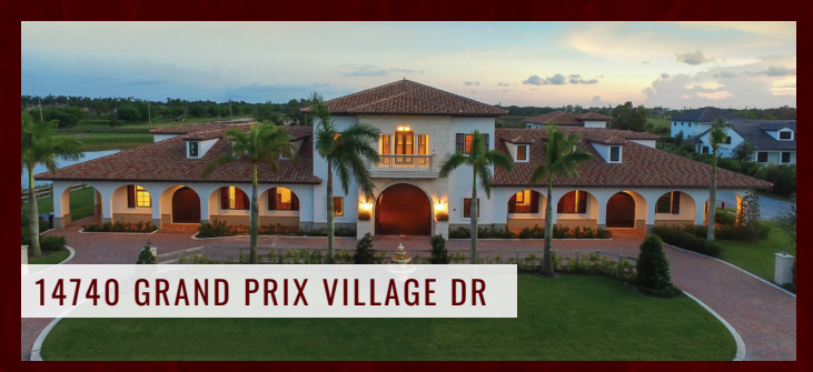
This exquisite Grand Prix Village South farm features a 20-stall barn with 2 tack & feed rooms, 4 wash stalls, laundry room, kitchen area, and more. There is a magnificent second floor, 1 bedroom owner's apartment overlooking the 210' x 120' riding arena and 5 paddocks. There is also a 2 bedroom groom's apartment. Offered at $7,950,000