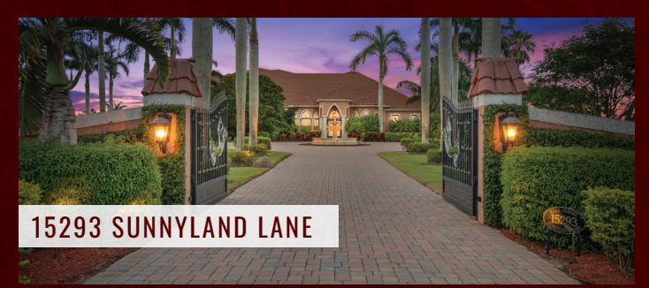
This Palm Beach Point equestrian property sits on 7.12 acres. The home has 4 bedrooms & 5.1 baths and features a state-of-the-art kitchen, resort-style pool, and an indoor bar with 1,100 bottle wine cellar. There is an 8-stall barn with 2 tack rooms, feed room, a studio apartment, 4 paddocks, and a large riding arena. Offered at $4,595,000.