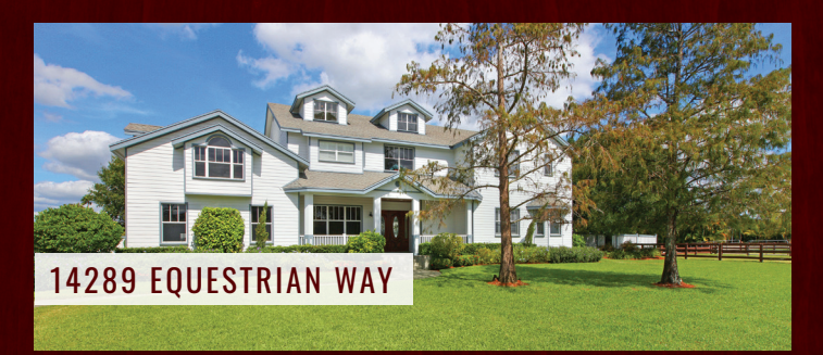
One-of-a-kind equestrian property in Saddle Trail on a double lot totaling 3.92 acres! This unique two-story Traditional style estate has 5 bedrooms, 4.1 bathrooms and a pool. There are two barns with a total of 17 stalls, a fully irrigated 200'X 130' riding arena, 10 paddocks, and more. Truly the discriminating equestrians dream! Offered at $5,400,000.