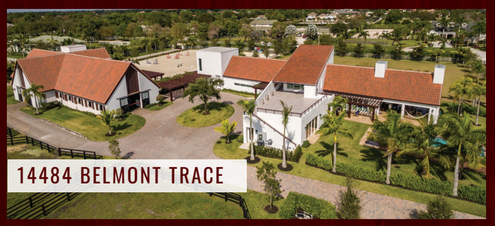
Spectacular 4+ acre equestrian facility in Saddle Trail! Equestrian features include a 16 stall barn, 2 feed rooms, 2 tack rooms, 8 paddocks, a treadmill, a 135'X 175' (approx.) ESI arena and a Derby field. Boasting over 5,700 square feet, the home has 4 bedrooms, 5.1 bathrooms along with numerous luxury upgrades. Offered at $8,990,000.