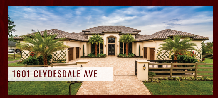
Immaculate 3.75-acre equestrian estate in Paddock Park 2 with numerous luxurious and equestrian amenities! Property boasts 9 bedrooms and 12 stalls, 2 Wordley Martin riding arenas, 2 lap pools, a putting green, regulation basketball court (1/2), and so much more! Come live the Wellington lifestyle in this turn-key equestrian estate! Offered at $5,699,000.