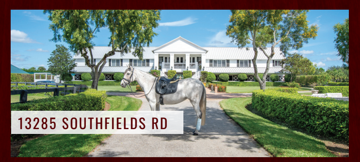
This stunning Southfields equestrian facility. "Hampton Green", has a total of 50-stalls, seventeen paddocks, features three professional arenas and comes with an elegant 4-BD owner's apartment, all on nearly 10 acres. Luxury-living, convenience to showgrounds, fantastic footing, and stall income is what sets this farm apart from the rest. Offered at $6,950,000.