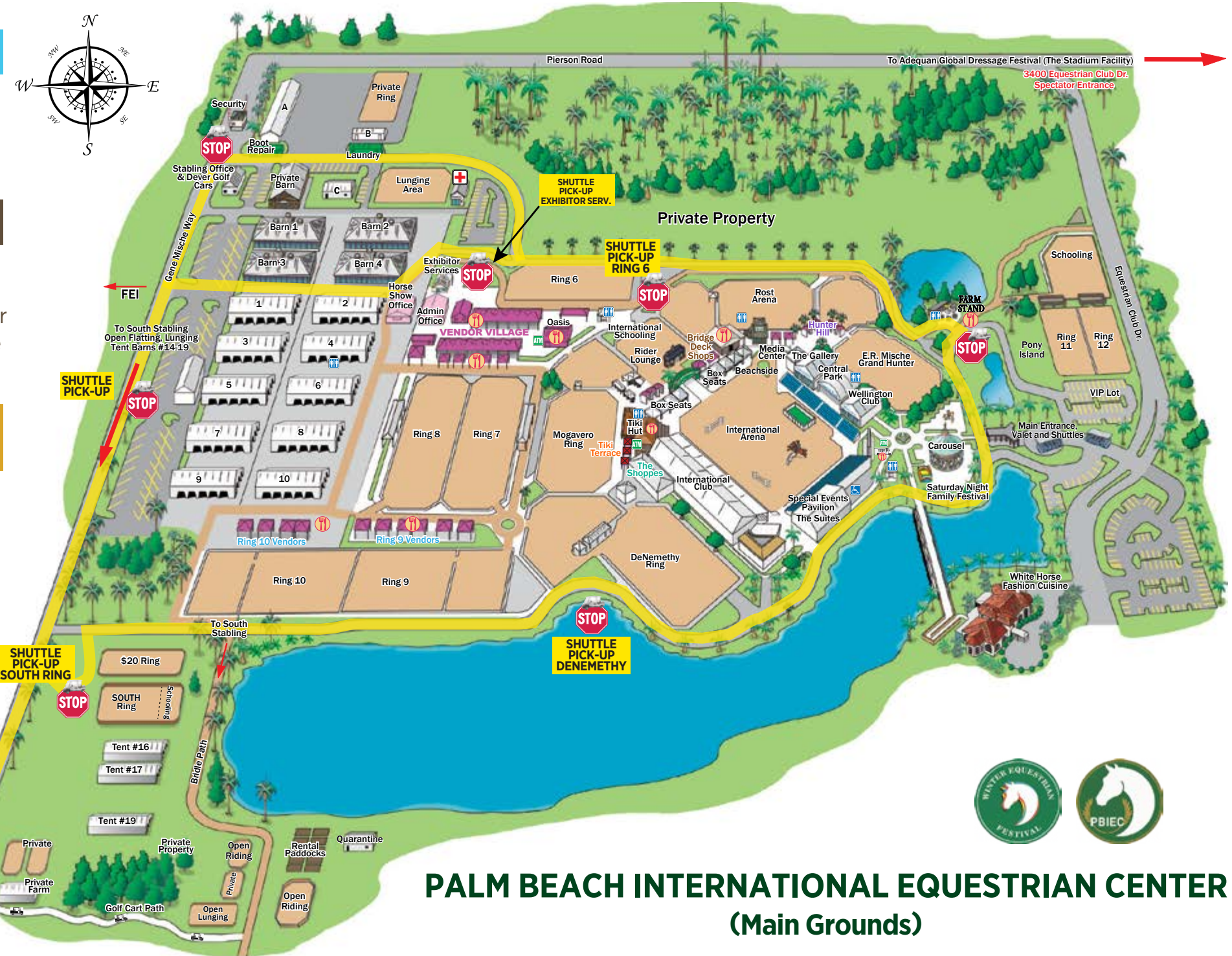
PALM BEACH INTERNATIONAL EQUESTRIAN CENTER (Main Grounds)