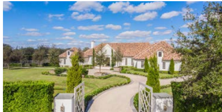
15495 Sunnyland Lane | 13 Stalls | $11.3M | Palm Beach Point