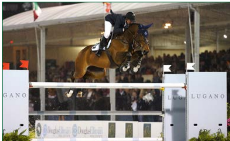
McLain Ward repeated a five-star victory at the 2020 WEF, this time with HH Azur at WEF 7.

Two-time U.S. Olympic team gold medalist McLain Ward won his third CSI5* in two weeks by taking top call in the $401,000 Lugano Diamonds Grand Prix CSI5* riding his 2016 Olympic mount, HH Azur, during "Saturday Night Lights" on February 22.