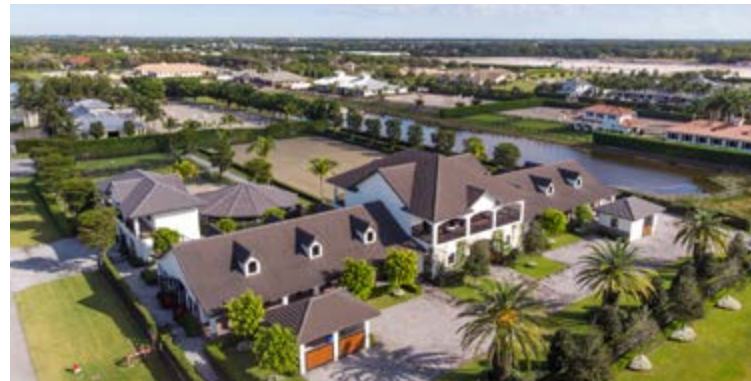
3888 Gem Twist Court | 20 Stalls | $11.5M | Grand Prix Village