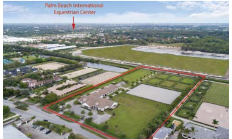
GRAND PRIX VILLAGE SOUTH | $10,995,000

2.98 Acres in Grand Prix Village | 14-Stall Barn | 6 Paddocks | 235' x 115' All-Weather Arena | Owners' Lounge with Kitchen and Bathroom | 2 Private Apartments | Staff Lounge with Kitchen | Outdoor Patio Overlooking the Ring | Summer Kitchen | Adjacent to PBIEC | Sold Furnished