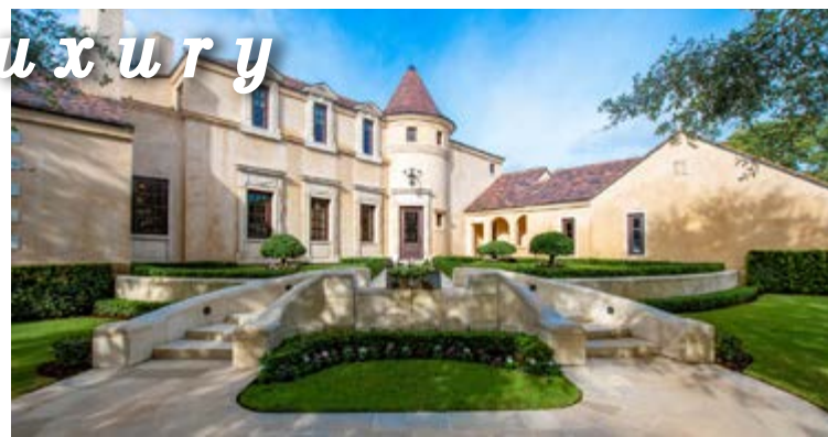
2930 Hurlingham Drive | $12.75M | Palm Beach Polo