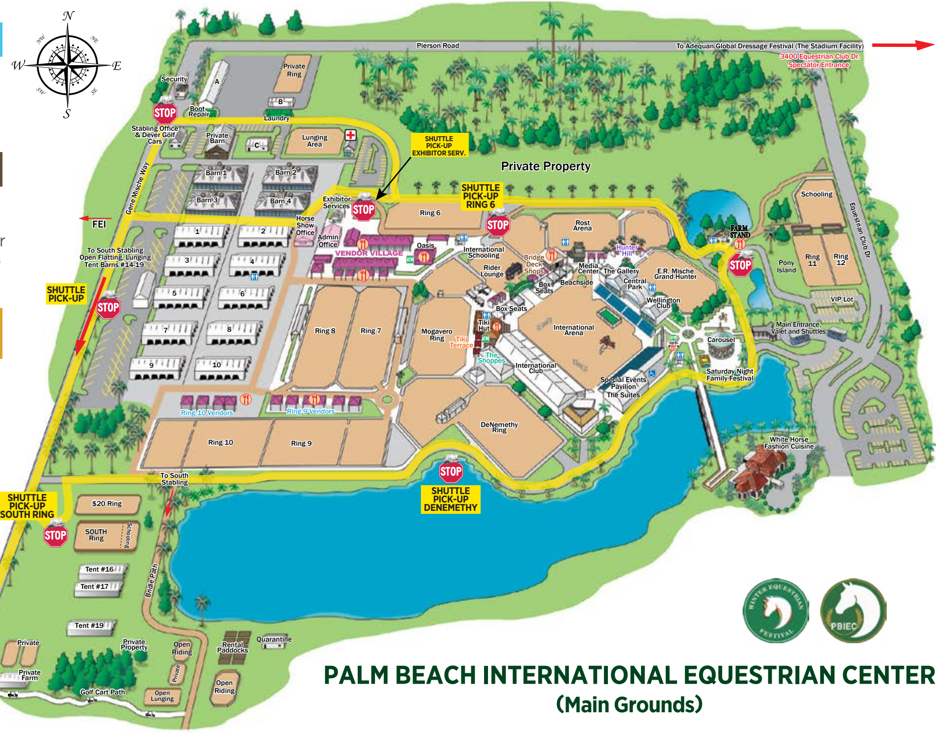
PALM BEACH INTERNATIONAL EQUESTRIAN CENTER (Main Grounds)