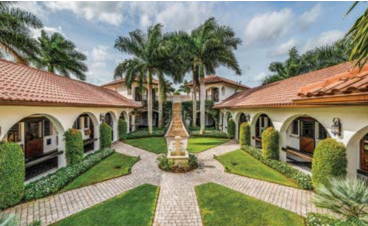
GRAND PRIX FARMS | $7,950,000

FOR THE GLOBAL EQUESTRIAN COMMUNITY | WELLINGTON, FL