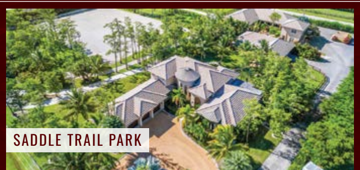
SADDLE TRAIL PARK

9+ Acres | 13285 Southfields Road | Offered at $6,950,000 50 Stalls, 4 Bedroom Apartment, 17 Paddocks