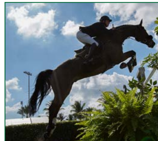
In his first time competing at WEF, Bertram Allen picked up two wins in two days, including in the $37,000 Equinimity WEF Challenge Cup Round 4 with GK Casper.

Action during week four of the 2020 Winter Equestrian Festival (WEF) had a change of scenery, with 80 riders crossing the road to the grass Derby Field at Equestrian Village (home to the Adequan® Global Dressage Festival) on Wednesday. It was third to go Bertram Allen whose round on Ballywalter Stables' Quiet Easy 4 proved unassailable in the $6,000 Bainbridge Companies 1.40m CSI4* class in the 24-year-old Irish rider's first event of the season in his first-ever visit to WEF.