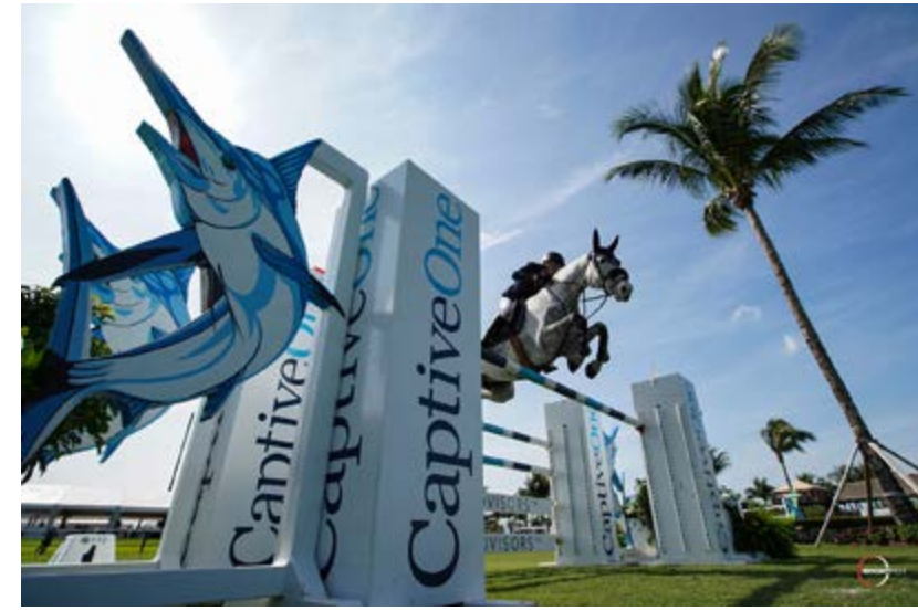
World number one Martin Fuchs (SUI) and Silver Shine won the $37,000 CaptiveOne Advisors 1.50m Class on Silver Shine (pictured) and took second with Stalando 2.

WEF 4 JUMPER HIGHLIGHTS Continued from Page 5 It was a blue-ribbon breakfast for 15-year-old Hailey Royce (USA) riding Goldbreaker in the $10,000 SJHOF High Junior Jumper Classic, presented by Griffis Residential, on Sunday, February 2, to close out Week 4. Royce and Goldbreaker were the only pair of the 16 horse-and-rider field to advance to an immediate jump-off and posted the only double-clear of the day in 39.722 seconds. Caelinn Leahy (USA) took second riding Dymendy, owned by Twenty 23 LLC, with the fastest four-fault round over the opening track. Also picking up a single rail, Rie Rose Lindegren Roed (DEN) was third on Newcomer 13 for owner JE Invest International, and Austin Krawitt (CAN) finished fourth on Gaesbekers Gabbert JE for owner AES Equestrian. Kathryn Hall (USA), capped the top five riding her own All In 9.