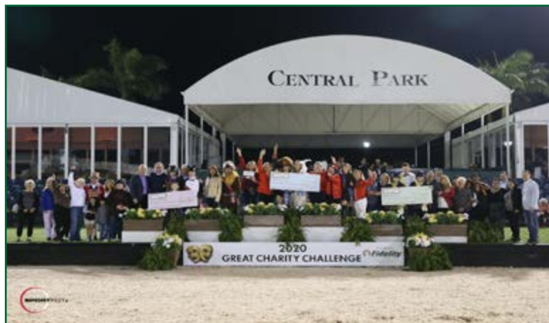
The top three teams, along with their charity and team sponsor representatives, for the 2020 Great Charity Challenge, presented by Fidelity Investments®.

Palm Beach County cheered as equestrians and their mounts, representing local non-profit organizations, competed for a share of more than $1 million in prize money at the Great Charity Challenge presented by Fidelity Investments® (GCC) on Saturday, February 1. Held at the Palm Beach International Equestrian Center (PBIEC), the GCC has become a highlight of the 12-week Winter Equestrian Festival (WEF) and has distributed over $15.8 million to more than 256 local organizations in 11 years.