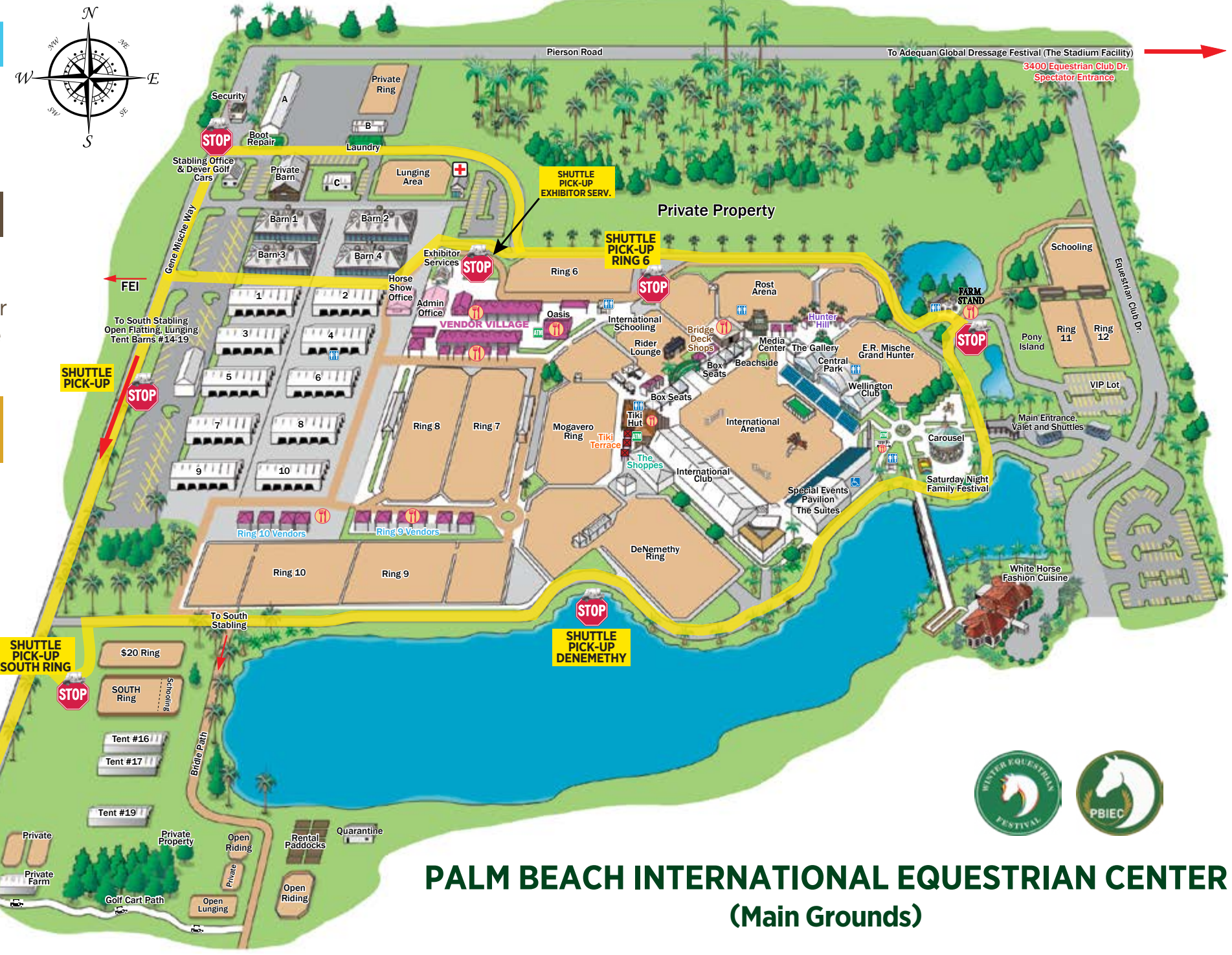
PALM BEACH INTERNATIONAL EQUESTRIAN CENTER (Main Grounds)