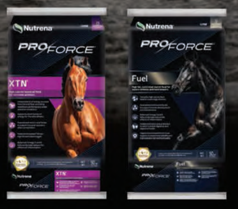
ProForceFeed.com ©2015 Cargill, Incorporated. All Rights Reserved.

You are in it to win it. And with ProForce® premium horse feed, you can count on advanced nutrition that delivers championship-caliber results. Each unique new formula combines world-class science, research and technology for unprecedented levels of performance, stamina and recovery. And with features like prebiotics and probiotics, high fat, guaranteed amino acids and organic trace minerals, you can trust Nutrena® to give your horse the focused power to finish (and stay) on top.